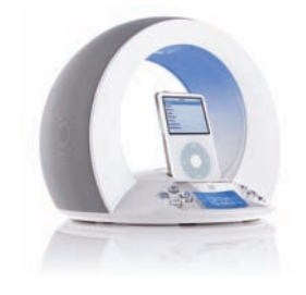
JBL On Time™ The clock radio that's playing your song.