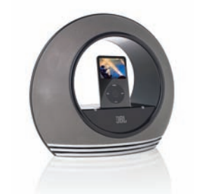
JBL Radial™ Surround your iPod with legendary JBL sound.